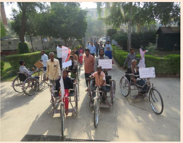
DIVYAANG AWARENESS RALLY

RR Morarka Charitable Trust has won Awards so far:-