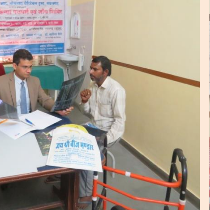
EXPERT DOCTOR'S CHECK UP