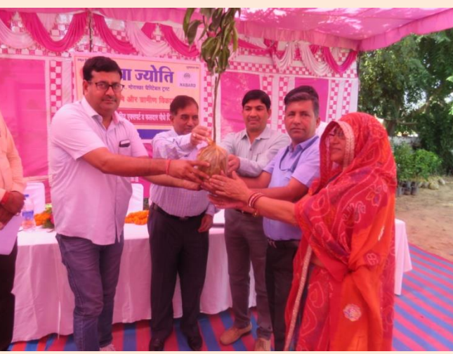
DM GIFTED PLANTS