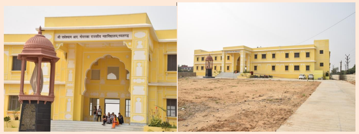
CONSTRUCTION OF SHREE RR MORARKA GOVT. COLLEGE