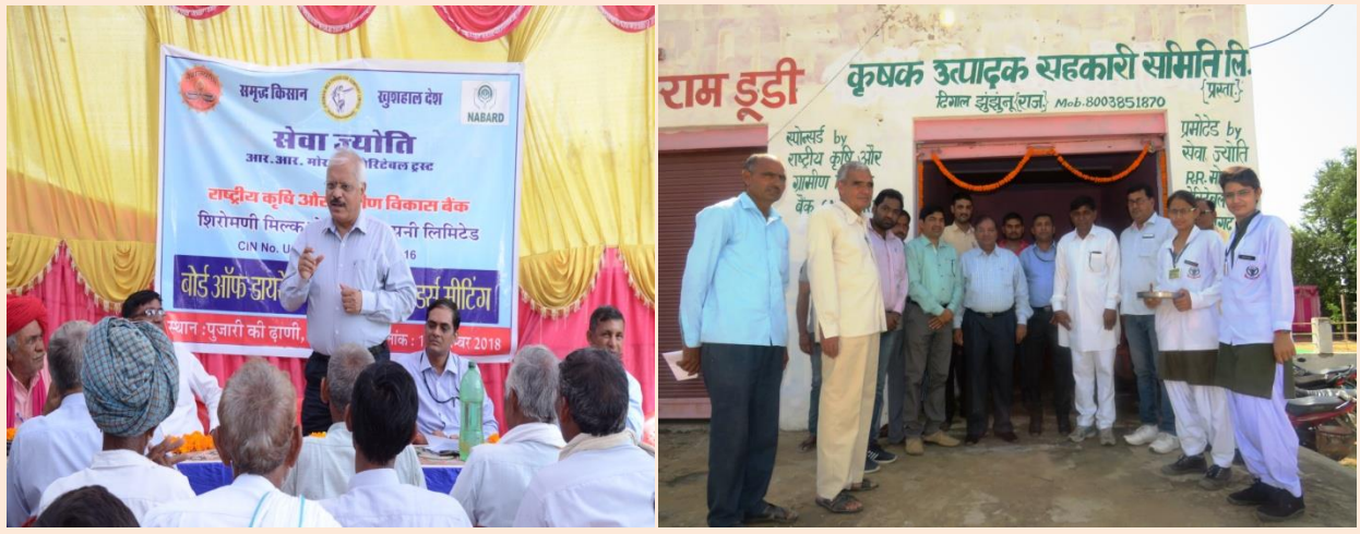
CGM VISIT @ FPO