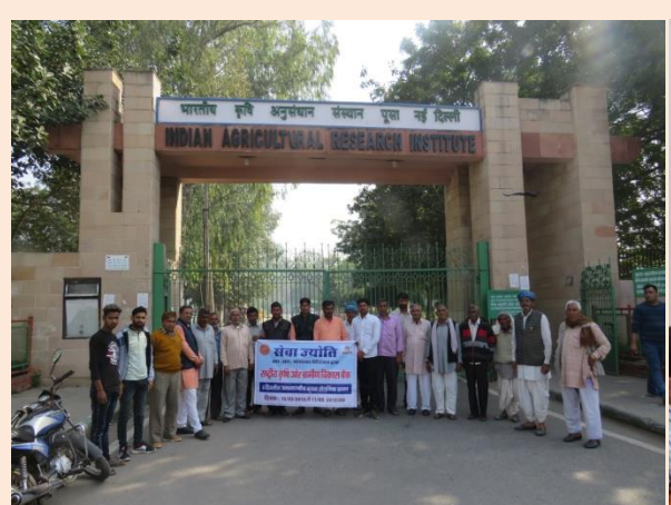
IARI NEW DELHI VIST