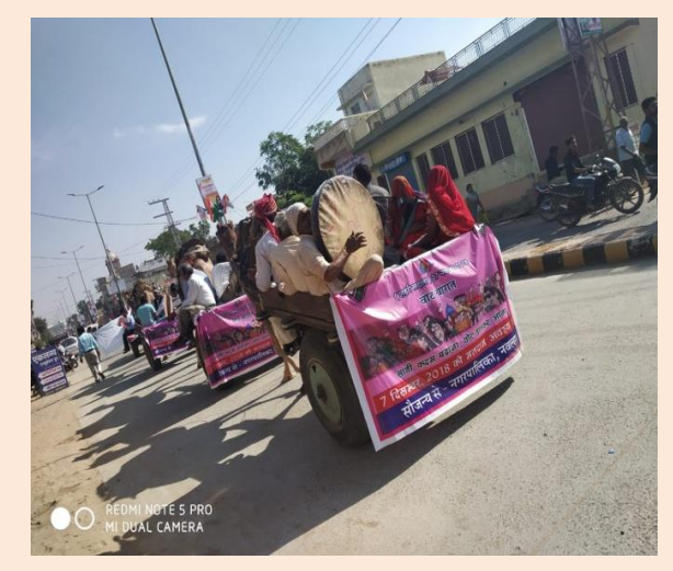
VOTER AWARENESS RALLY