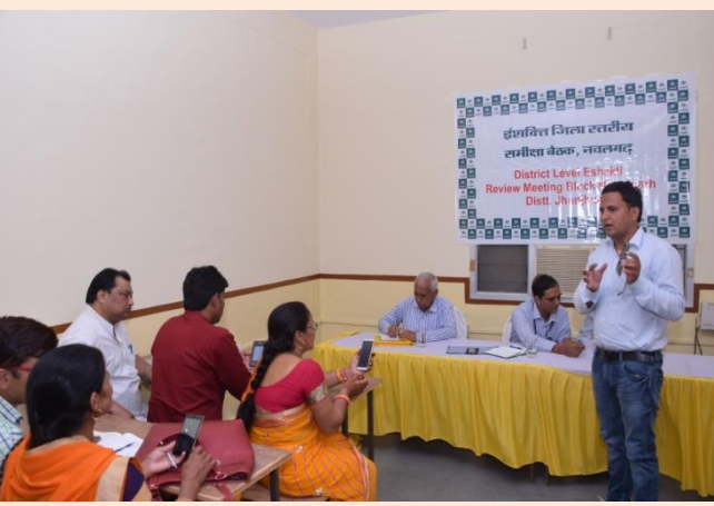
E SHAKTI REVIEW MEET