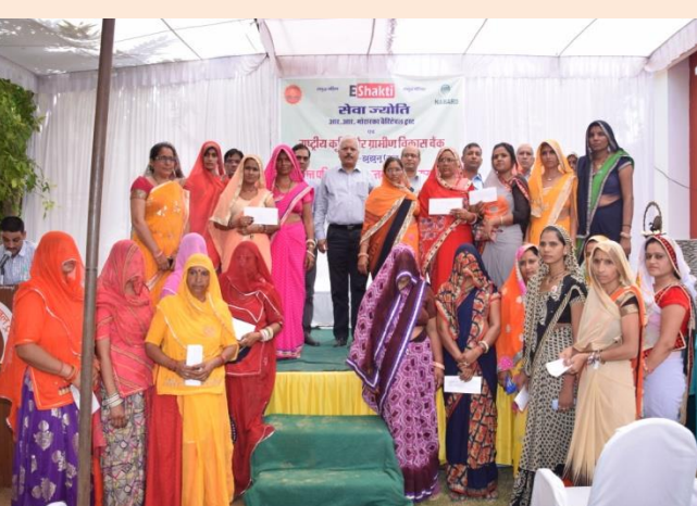
CGM @ CREDIT MELA