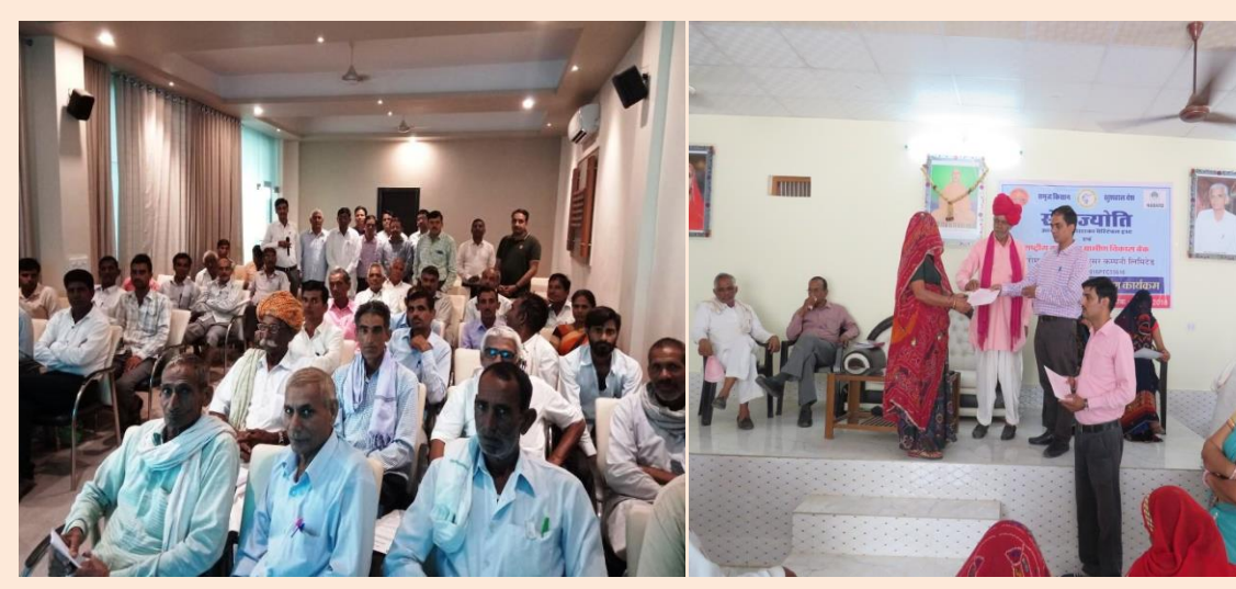
NCDEX with FPO WORKSHOP

Sewa Jyoti organized voters awareness program through tricycle rally and voter Barat to aware the community to ensure 100% voting, Block administration also participated in the program, SDM Nawalgarh flag off the rally and Voter Barat.