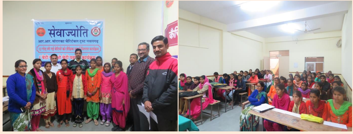
BETI BACHAO BETI PADHAO