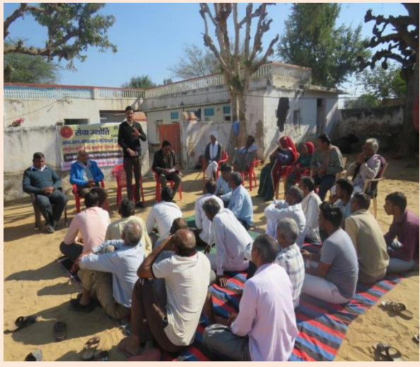
FARMERS CLUB MEETING